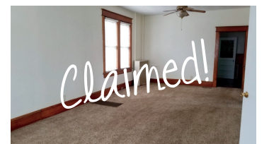
Community Meeting Room