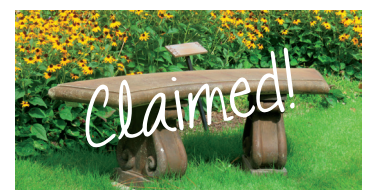
Bench in Pollinator or Shade Garden