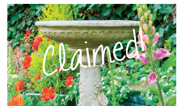
Carved stone bird bath in Pollinator or Shade Garden